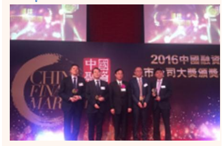
Yuexiu Property wins "Best Corporate Governance Award"

The first phase of the project is comprised of seven high-rise residential buildings and two blocks of boutique apartments, including flats of 75 sq.m. to 110 sq.m. with two to four rooms and loft apartments of 35 sq.m. to 55 sq.m. In addition, the project will also include a large commercial complex by the bank of the Pearl River. The commercial complex will contain a shopping mall and a theme commercial street with facilities for entrainment, leisure and culture.